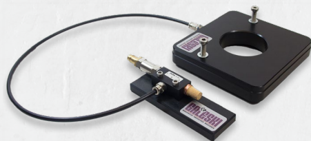
Vacuum suction plate and venturi set as accessories possible.