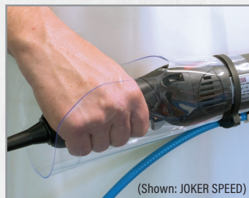
(Shown: JOKER SPEED)

With transparent, flexible splash guard. Advantage: Less moisture and dirt gets into the machine.