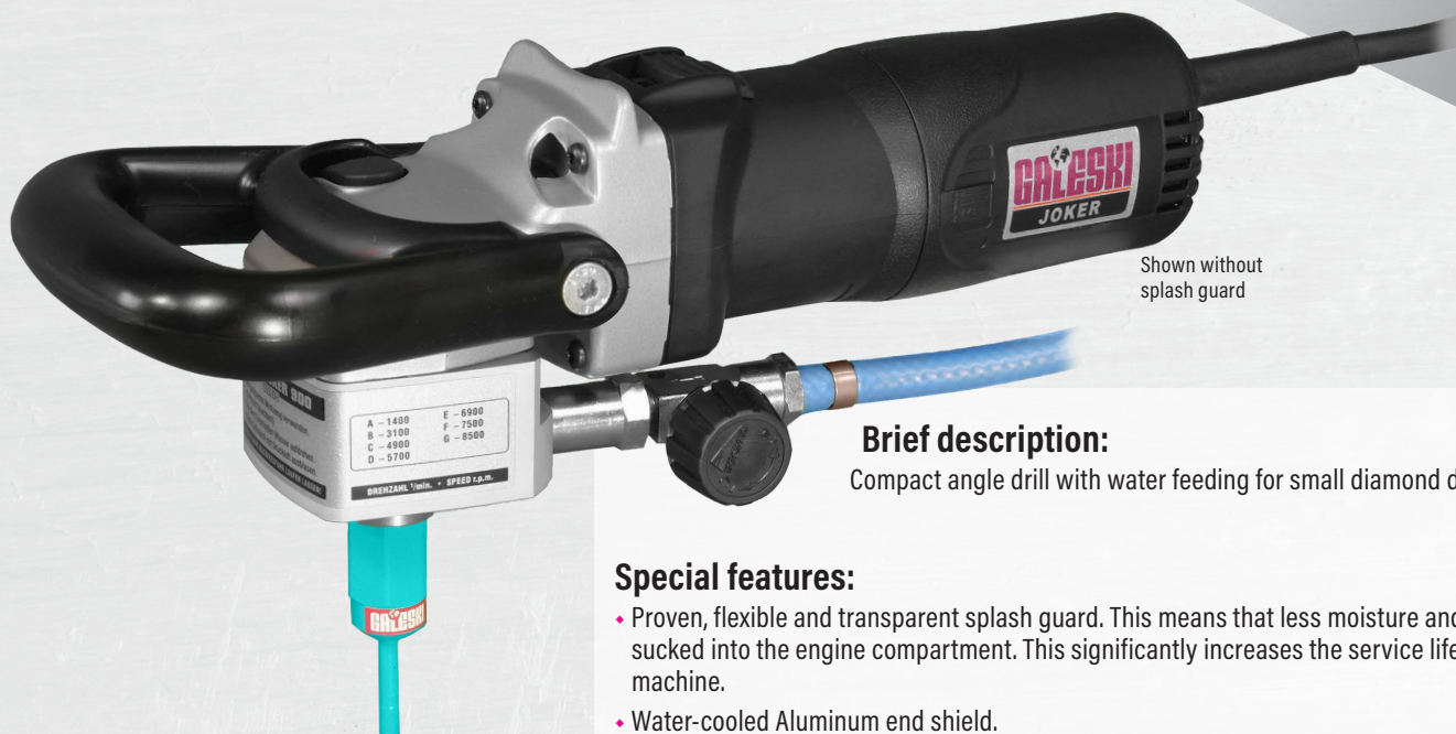
Shown without splash guard