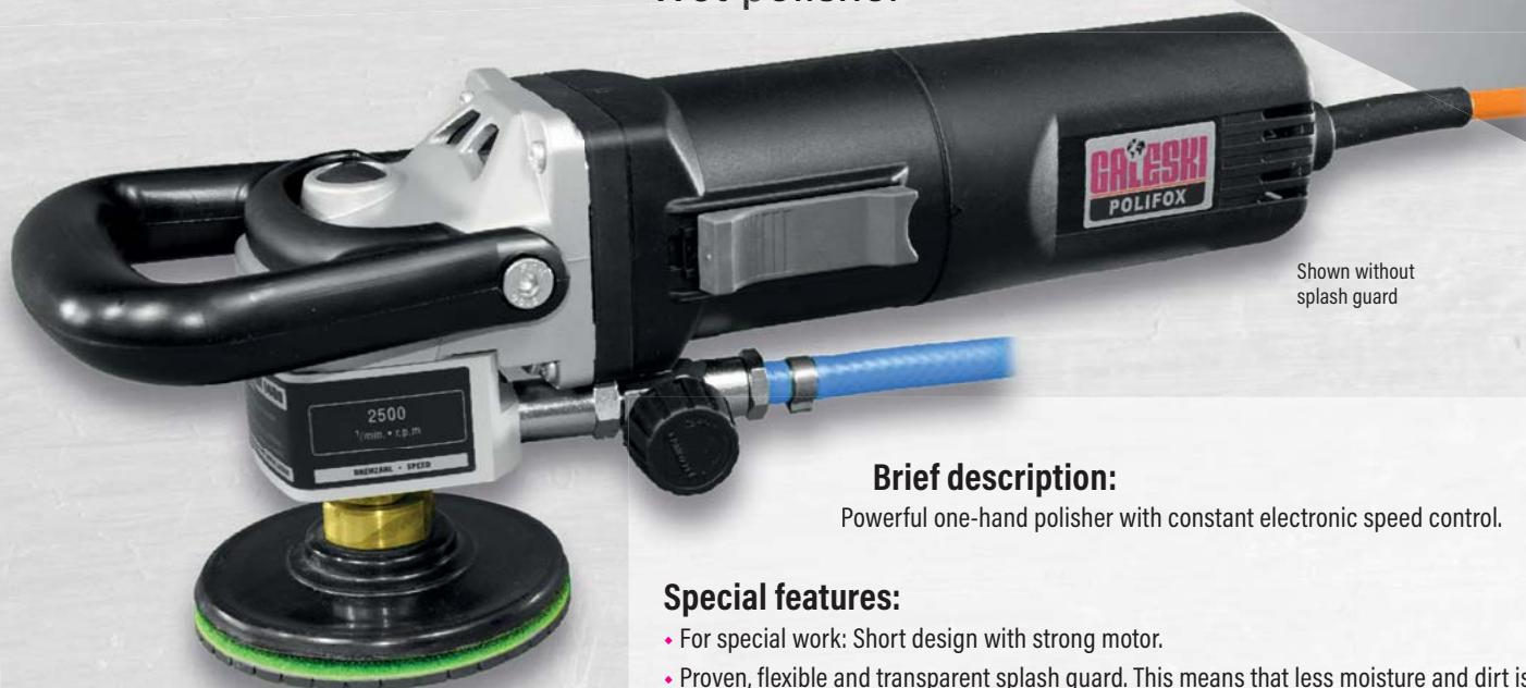
Shown without splash guard