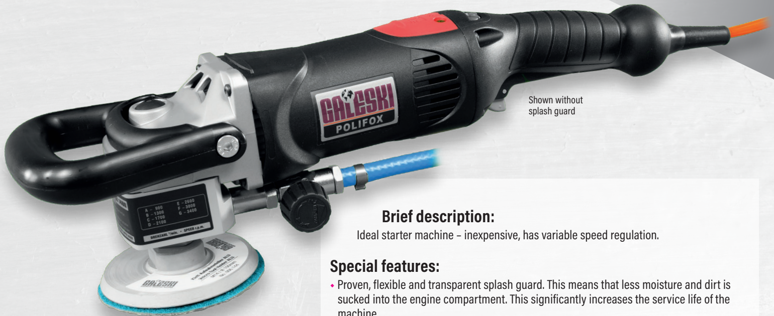
Shown without splash guard