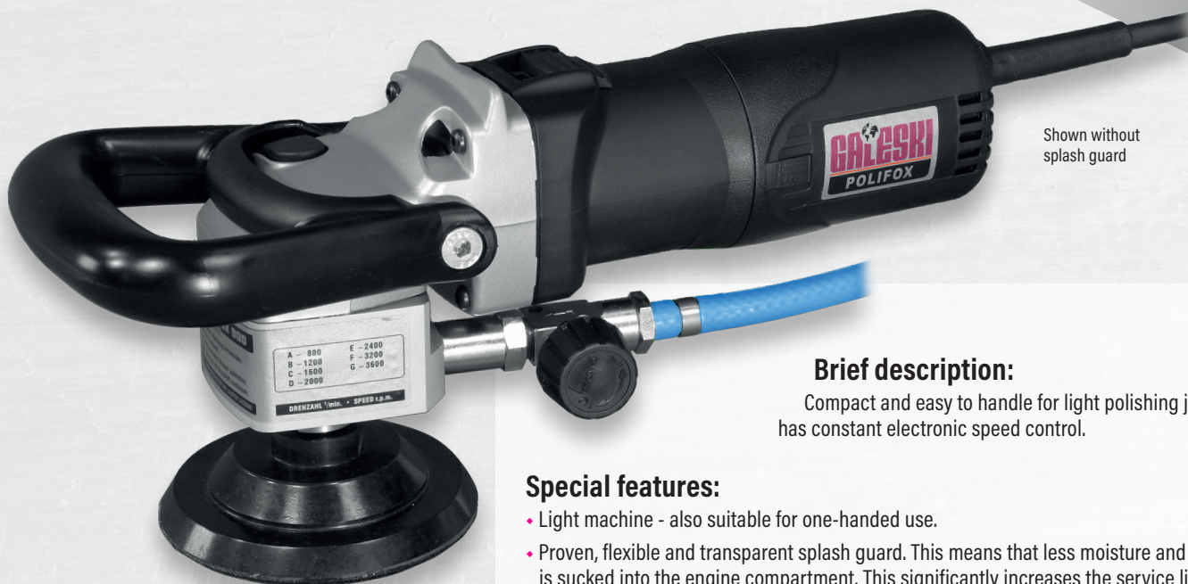
Shown without splash guard