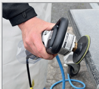
Also suitable for one-handed use.

Spindle mounting in rinsing head, with water sealing underneath.