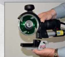
The guide plate can easily be removed for freehand cutting.